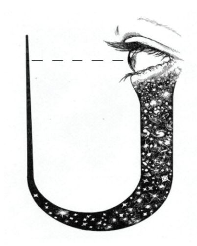
Figure 3. The point of view of a mystical reader of the Tractatus <sup>23</sup>

sides are annihilated (dissolved). An interesting metaphor for this idea would be to consider language assuming the shape of a "Klein bottle" or of a "Möbius strip", or even as assuming the disposition of "Wheeler's participatory universe". In a sense, everything would be language. In a further sense, not even language would be anything. Any and every manifestation would be taken here as "secondary", and they could all be traced back to this ultimate and even more general reality that the thinker, in a "suicidal quest", aims to elucidate. However, given that this search will be an unsuccessful one – let us not forget that the failure of this process is foreseen beforehand and that this would happen because language cannot overcome (go beyond) the realm in which it was originally developed (conceived) –, the result of this inquiry must be abandoned. The entire outcome is inferior beyond comparison when contrasted to the initial goal of the investigation.